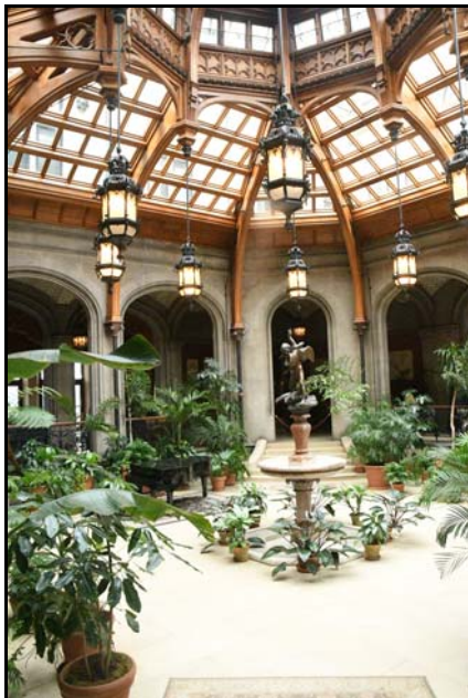
The Conservatory in the House