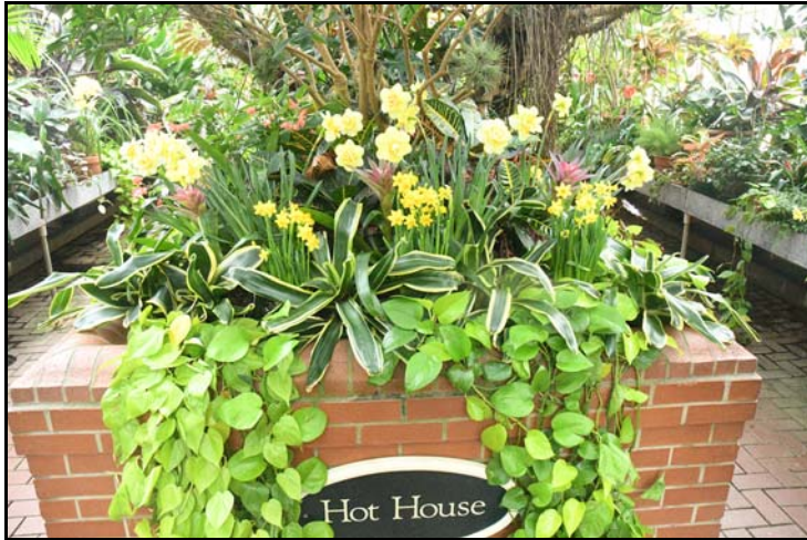
A view inside the Greenhouse

The Greenhouse was separated into different sections. It reminded us of the Garfield Park Conservatory on the West Side of Chicago.