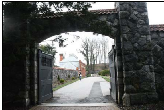
The Greenhouse about a block away from the main house.