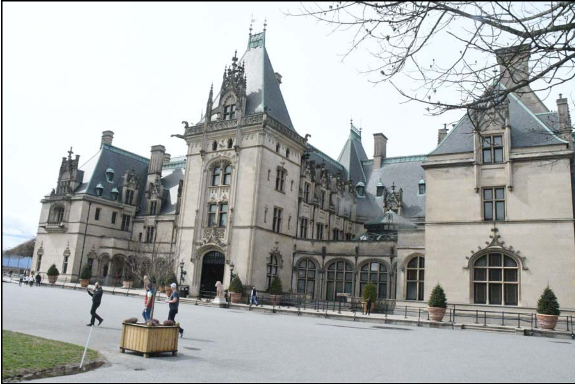
George Washington Vanderbilt II's Biltmore Estate Established 1895

On February 24 th we went to Charlotte, NC to the Biltmore Estate. We really enjoyed the Servants Tour. The Conservatory was located a block away from the house. It had a lot of beautiful daffodils, tulips, foliage plants, orchids and bromeliads.