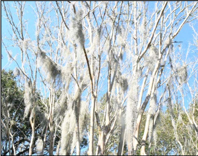
South Carolina Trees with Spanish Moss in February.

From there we drove to Myrtle Beach, South Carolina and then to the Brookgreen Gardens which is a sculpture garden. It was founded by Archer and Anna Huntington. The sculpture garden has all sizes of sculpture. We saw Spanish Moss hanging from the trees there.