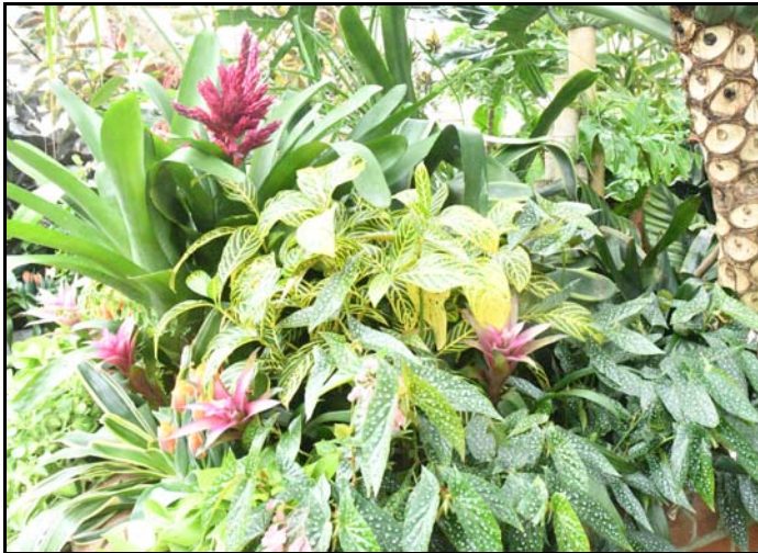
Aechmea and the inflorescence.

The Greenhouse was separated into different sections. It reminded us of the Garfield Park Conservatory on the West Side of Chicago.